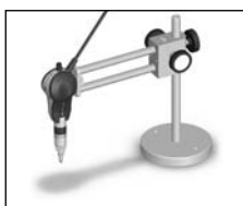
Focusing stand (0VSS065) with Ersa MOBILE SCOPE