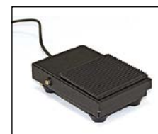
Foot switch for triggering image