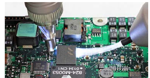
Inspection of a micro-BGA

The practical aluminium case for the Ersa MOBILE SCOPE offers safe storage of the inspection items and transportation of the system to any location wherever it is needed.