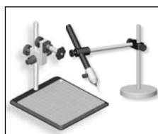
Focusing stand (0VSS060) & LED brush light stand