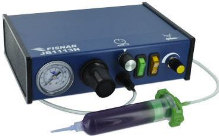
JB1113N with Foot Pedal and 30cc Syringe

A popular analog dispenser series featuring dual 110/220V operation. An all-purpose dispenser, versatile and easy to use in a few simple steps – hook up the barrel adapter assembly (selection included) - connect the air and power - set the timer - load the barrel with material - set the air regulator – press the foot switch and start dispensing.