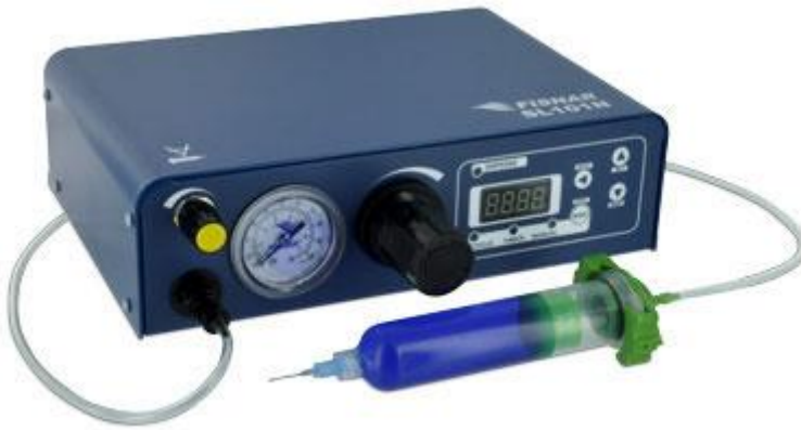
SL101N with Foot Pedal and 30cc Syringe

An automatic digital dispenser with a bright LCD display and "teach & learn" process programming. Up to 9 independent dispensing programs may be stored for fast recall.